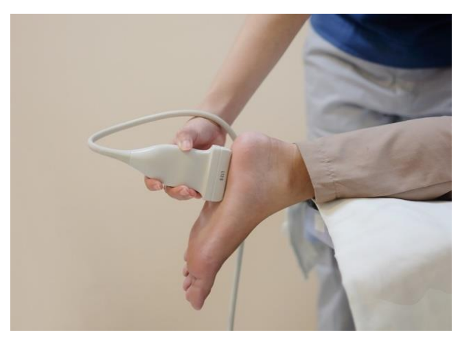
Figure 1. The transducer was hold vertically to the medial side of plantar near the calcaneal origin of the fascia.

The statistical analyses were calculated using SPSS 24 for Macintosh. The difference in fascia thickness between male and female was examined using the Mann-Whitney test. Wilcoxon test was used to compare the right and left foot. Linear regression analysis was used to determine the variables that had the most significant correlation with fascia thickness.